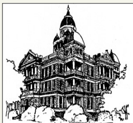
1896- Denton County Courthouse-

The Denton County Genealogical Society meets on the second Thursday during the months on September-November and January-May. 6:30 P.M.