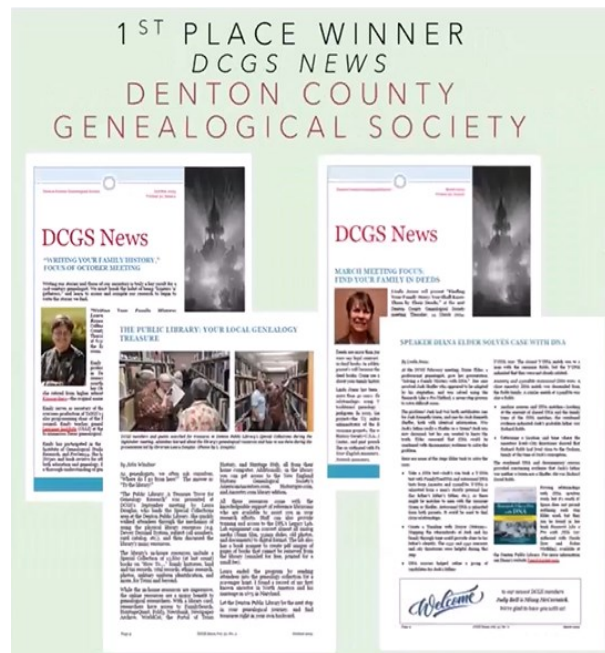
Screenshot from the virtual TxSGS 2024 Writing Awards ceremony.