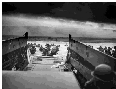
In the public domain.